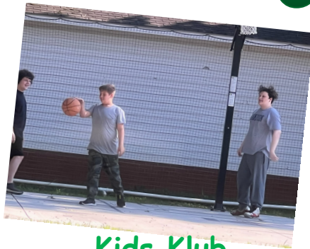
Kids Klub Activities this past week.