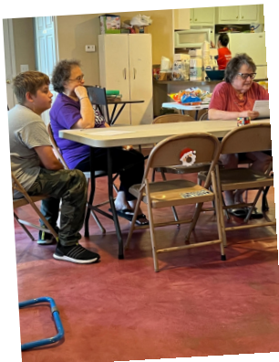
Pray for our Kids! As they go back to school.