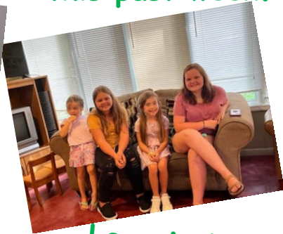
Learning! Fun! And a Cookout on Friday!