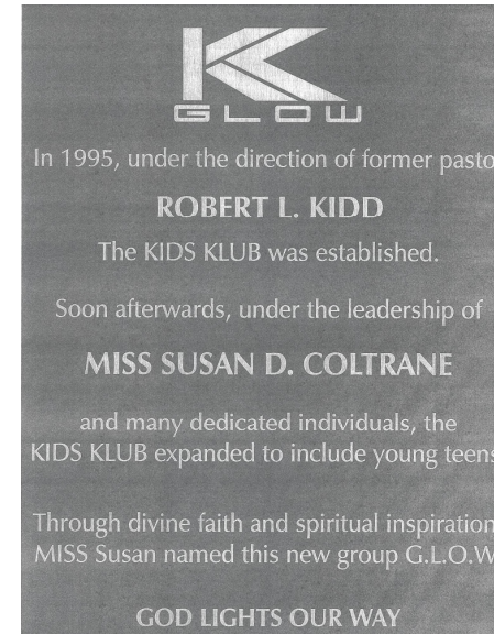
Plaque for the right side column

On Sunday, June 12, 2022 Monthly Meeting approved proceeding with the project to add brick columns and a brick paver walkway at the gap in the Playground fence after the construction of the Alan Boone Court last year.