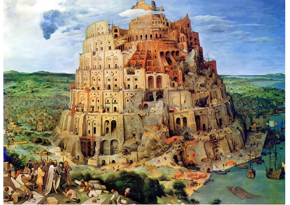
Pieter Bruegel the Elder, The Tower of Babel (1563).

Mailing Address PO Box 987, Asheboro, NC 27204-0987