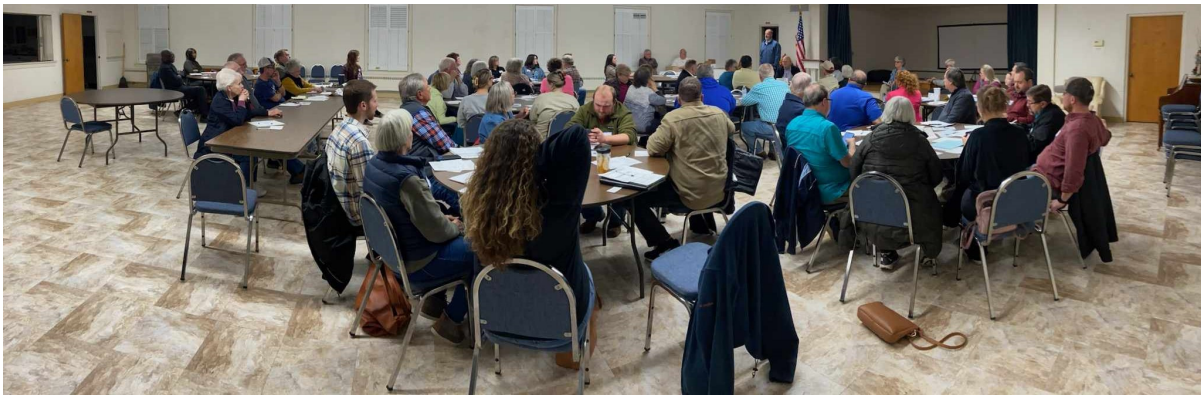
Class Act Team Leaders gather in the Fellowship Hall at Asheboro Friends on February 29, 2024.