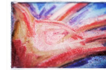
The Gospel According to Friends Wilmer A. Cooper Pamphlet Series | Friends United Press

Just as bank tellers need a thorough knowledge of legitimate currency in order to spot counterfeit bills, so Christians need a thorough knowledge of the Bible in order to spot bogus religious teachings. How grounded are you in the Scriptures? How deep are your theological roots? How capable are you of detecting false teachings?