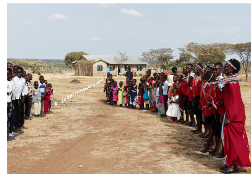
Young people from Samburu Friends Mission