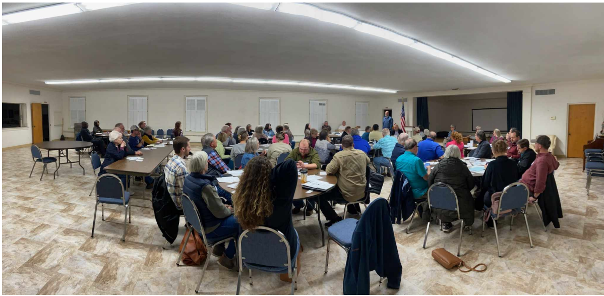
Class Act Team Leaders gather in the Fellowship Hall at Asheboro Friends on February 29, 2024.