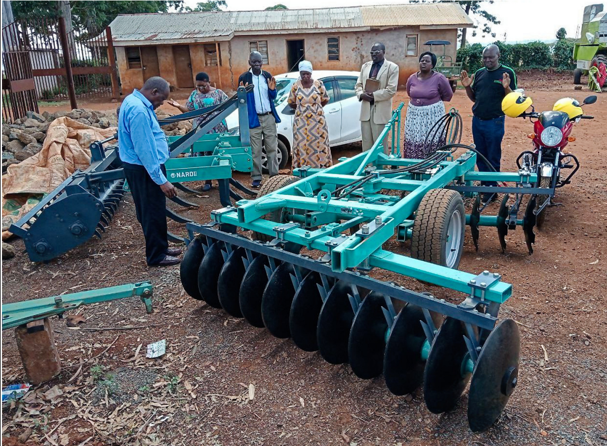
Members of the Ambwere Farm committee and other Friends pray over new equipment that was purchased this month for the farm sustainability project, near Kitale, Kenya.